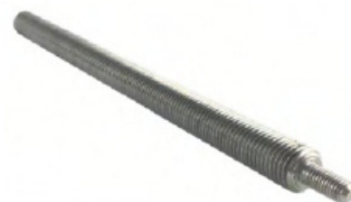
ROD FOR FIXING IN WALL WITH INSULATION