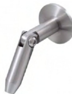
CONNECTOR WALL-TENSION ROD