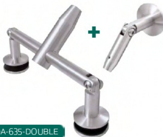
DOUBLE CONNECTOR WALL-TENSION ROD-GLASS