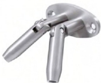
DOUBLE CONNECTOR WALL-TENSION ROD