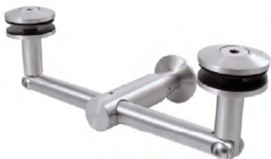
DOUBLE CONNECTOR WALL-GLASS