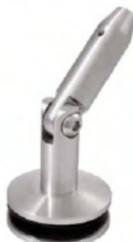
CONNECTOR TENSION ROD-GLASS